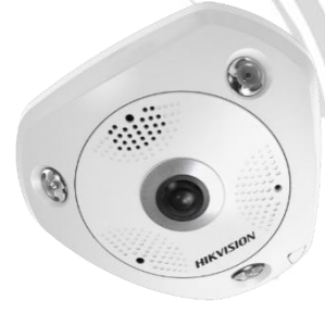
Without -V Model