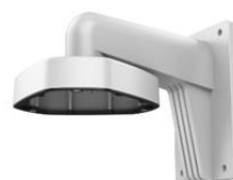
DS-1273ZJ-DM25 Wall Mount