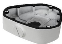
DS-1281ZJ-DM25 Inclined Ceiling Mount