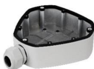
DS-1280ZJ-DM25 Junction Box