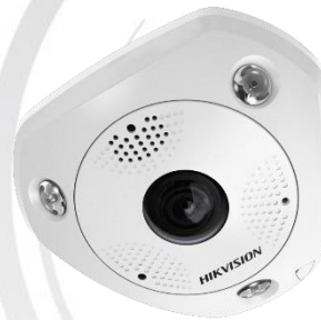
With -V Model