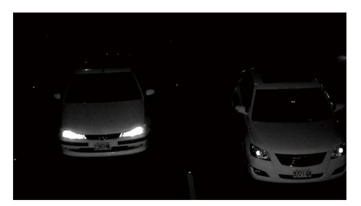
Supreme Anti-Glare Capability: Clear Image Captured with IR Illuminators and Headlight Filter