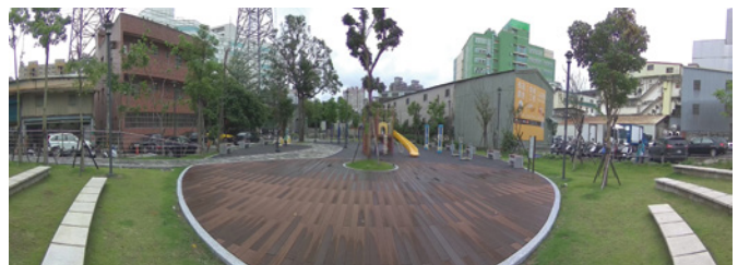
8MP Panoramic View