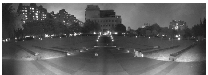
Panoramic IR Illumination