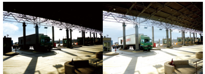
Without WDR Pro