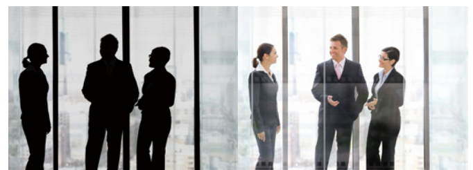
Without WDR Pro